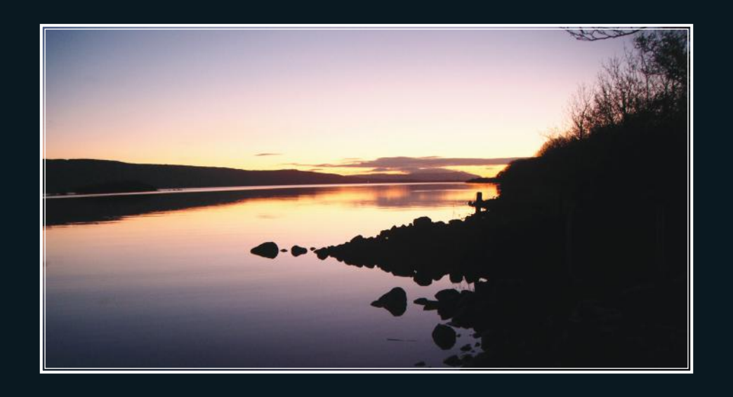
Escape to a haven of peace and tranquility